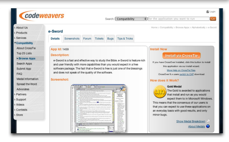
CrossTie makes it quick and simple to install Windows software from our CodeWeavers Compatibility database.

One of the coolest features CrossOver has is CrossTie. CrossTie is basically a "recipe" that tells CrossOver how to install a particular Windows software title. Any application in our C4 database that has a CrossTie file written for it (and there are more than a thousand of these) can be installed by simply going to that application's C4 page, and clicking on the Orange Install via CrossTie button. Doing so downloads the CrossTie recipe, and fires up CrossOver's installer. All the user has to do is click Install, and CrossOver does the rest. CrossTie